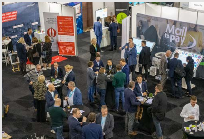
2019 – Brabantal Leuven (21 November)