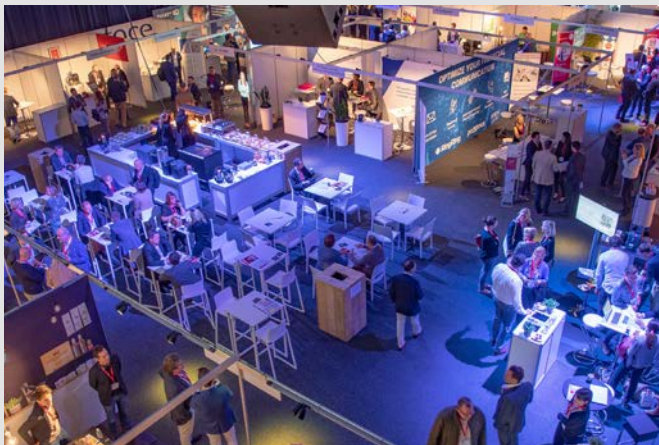
2018 – Docks Dome Brussel (18 October)