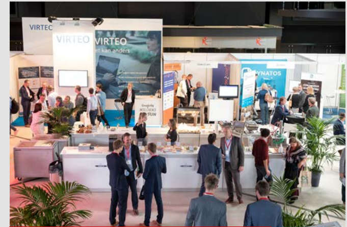
2017 – Flanders Expo (19 October)