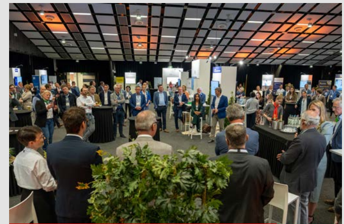
2022 – De Montil Affligem (21 April)