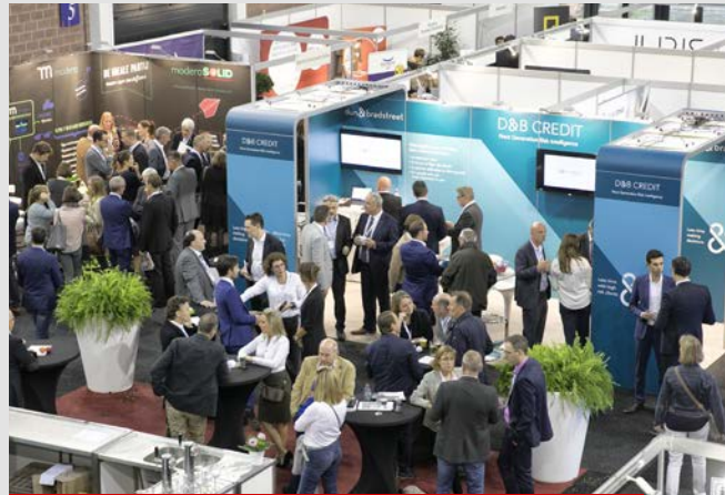
2016 – Brabantal Leuven (20 October)