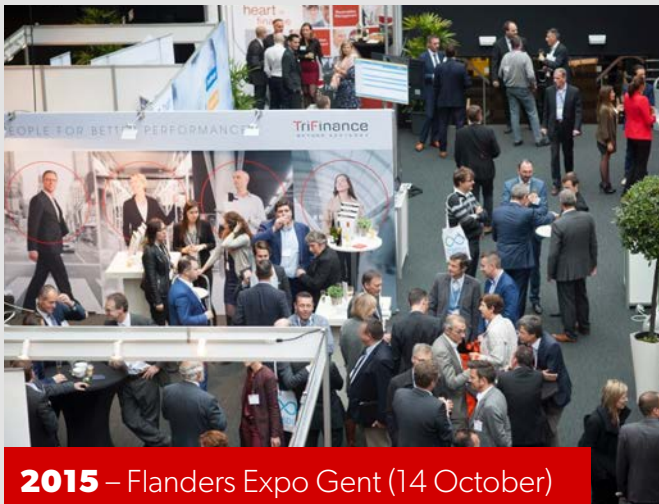
2015 – Flanders Expo Gent (14 October)