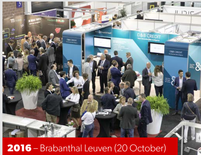
2016 – Brabantthal Leuven (20 October)