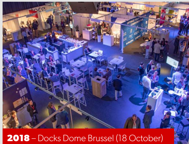
2018 – Docks Dome Brussel (18 October)