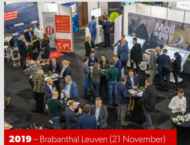
2019 – Brabantthal Leuven (21 November)