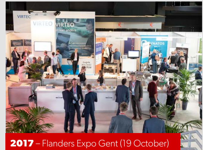
2017 – Flanders Expo Gent (19 October)